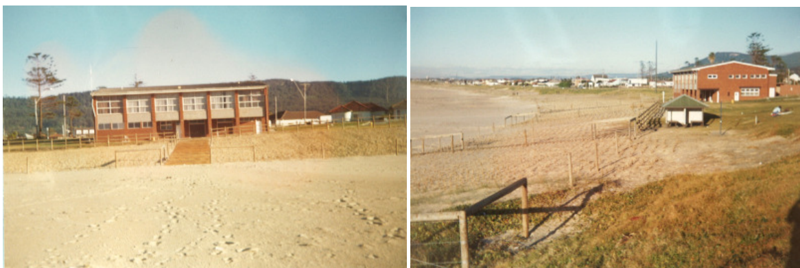
Figure 1. Photographs showing the dune restoration works carried out at Woonona Beach in 1986.

Council engaged consultants to develop design options for the proposed vegetation removal and reshaping work, undertake a Review of Environmental Factors including assessment of risk from coastal hazards and prepare detailed design plans suitable for construction.