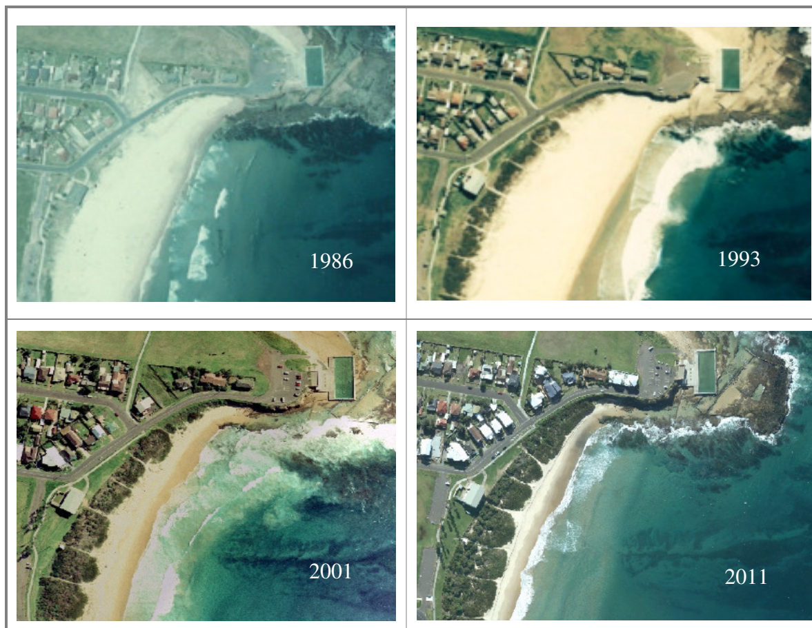
Figure 2. Aerial photographs of Woonona Beach showing vegetation spread over time (not georectified; for illustrative purposes only)