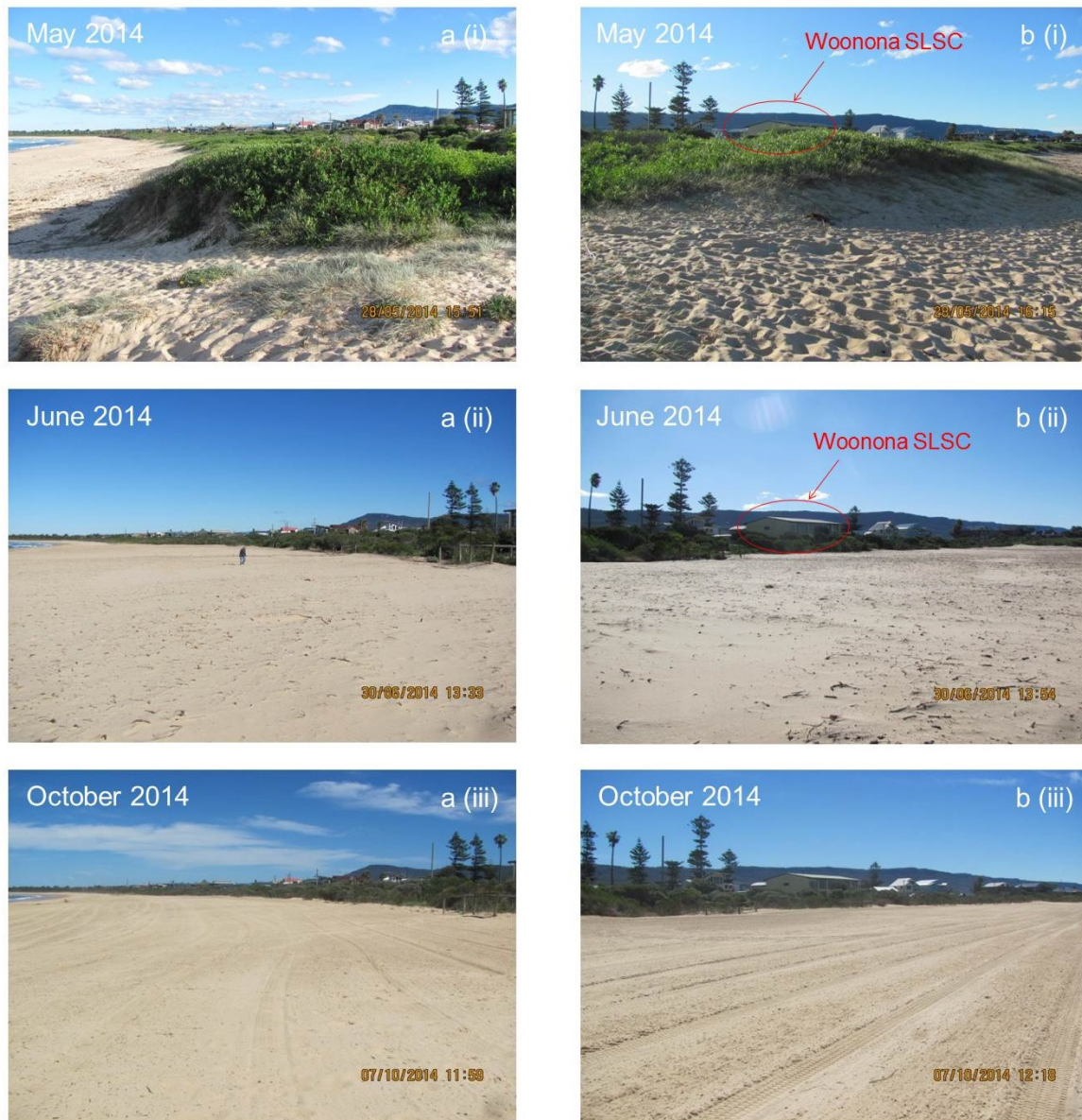
Figure 3. a) View of Woonona Beach from the north (a) and south (b) before reshaping (i) 10 days after (ii) and four months after (iii)